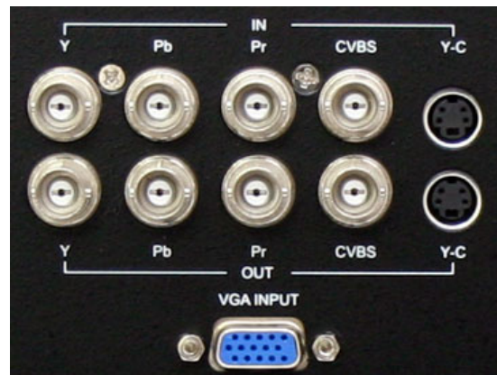
Figure 3: (right) Close up of rear panel inputs showing 8 BNC connectors (in & out) for HD component (Y Pb Pr) and composite video per LCD screen, along with S-Video connectors for Y-C video and a VGA input connector. All loop-thru connectors are active and auto-terminating.