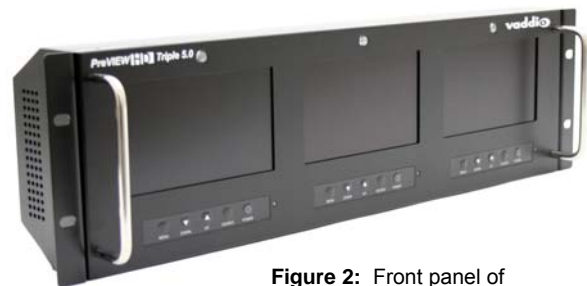
Figure 2: Front panel of PreVIEW HD Triple 5.0 LCD