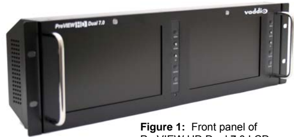
Figure 1: Front panel of PreVIEW HD Dual 7.0 LCD

Vaddio's PreVIEW HD line of monitors are excellent for a variety of applications that require high resolution monitoring of HD cameras, including houses of worship, training rooms and board rooms at corporate facilities, as well as instructional facilities at teaching hospitals.